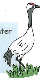
Red-crowned Japanese Crane

Narawara, where the dead Mongolian Oak, eroded by seawater, still remains standing. It is located at the middle point of the Notsuke peninsula Road (the Flower Road).